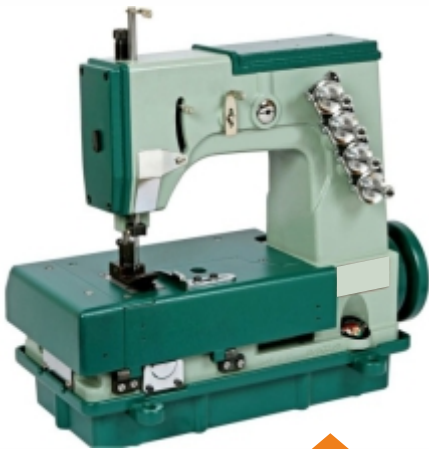
SEWING MACHINE 502