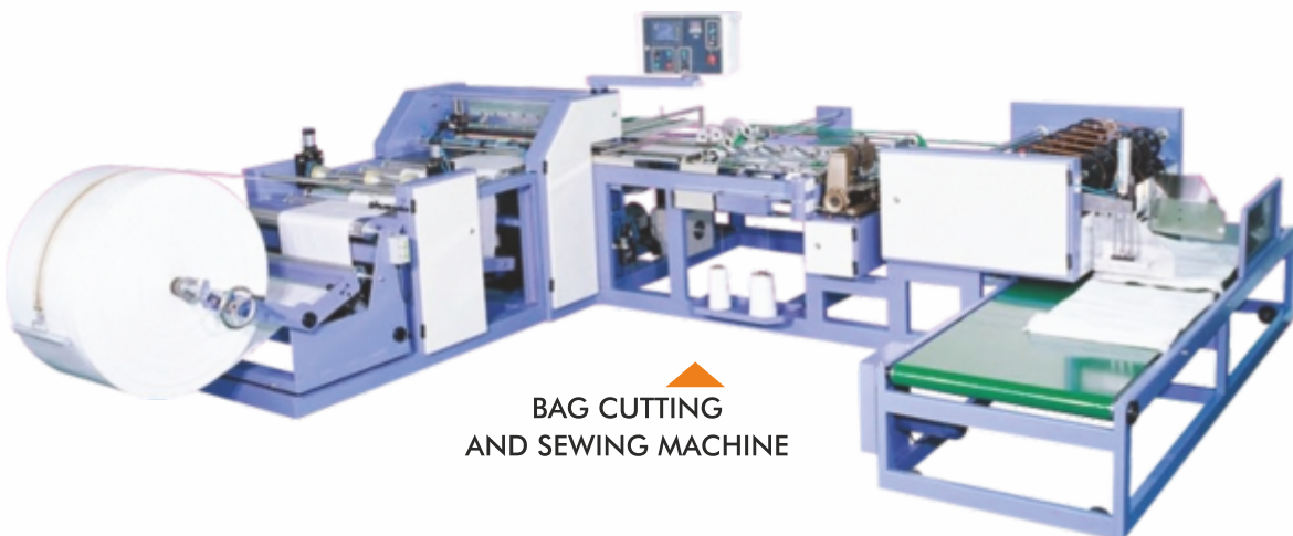
BAG CUTTING AND SEWING MACHINE