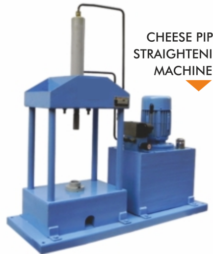
CHEESE PIPE STRAIGHTENING MACHINE