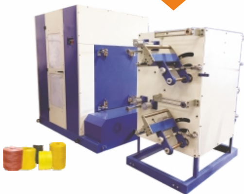
INFLOW TWISTER FOR BALER TWIN