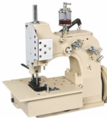
SEWING MACHINE 602